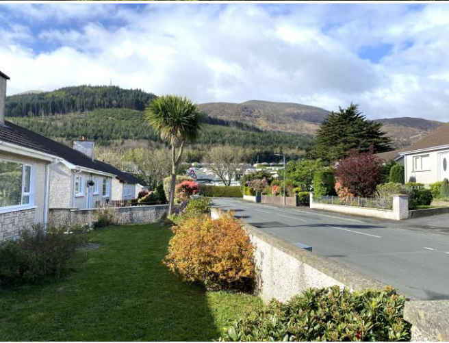
Rates for the year 2023/24: £1,020.39

If you are considering the sale of your own property, we would be pleased to provide you with a valuation. We are in a position to introduce you to a Financial Adviser in respect of arranging a mortgage, please ask for details