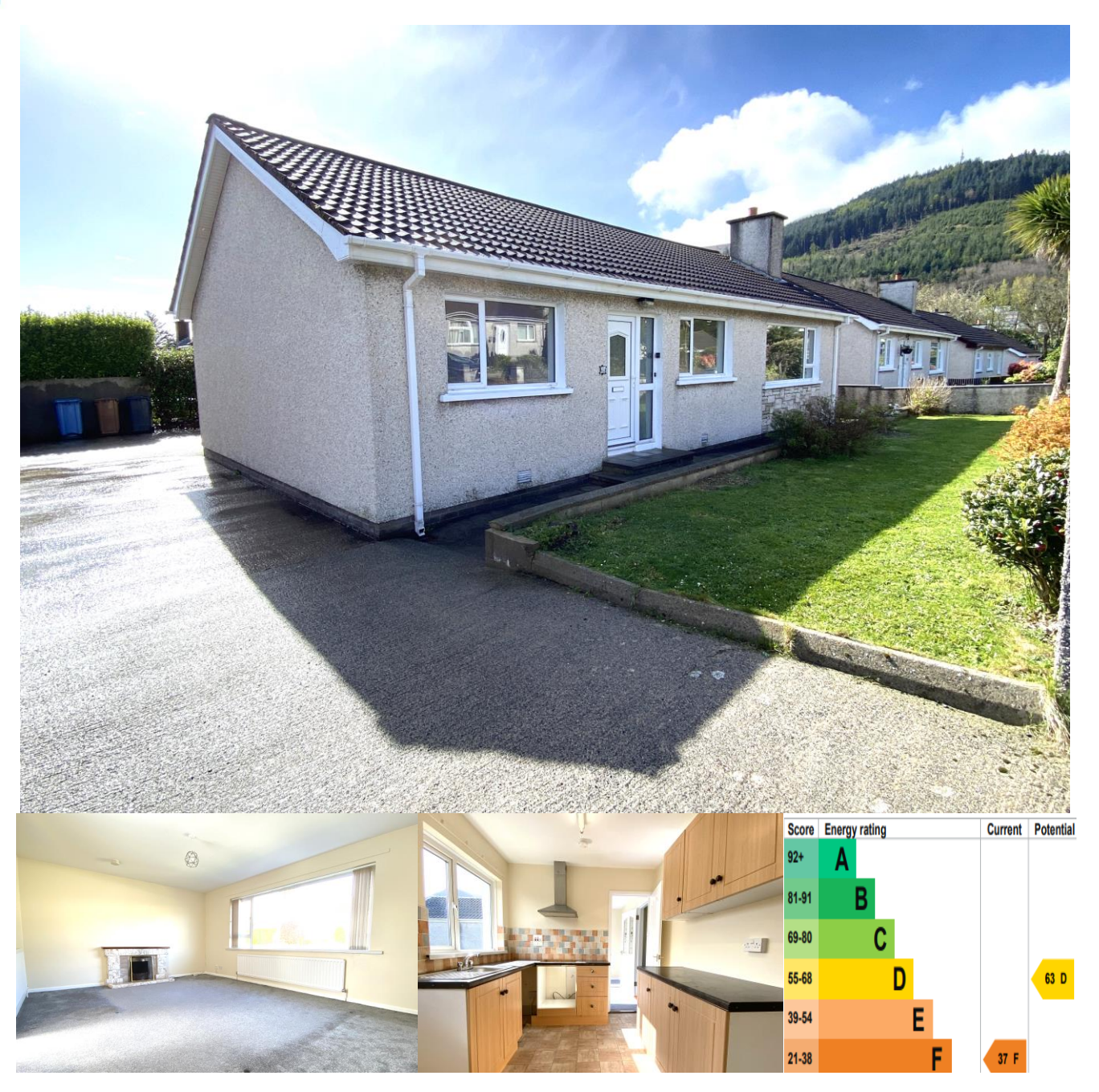
Let's point you in the right...... DIRECTION