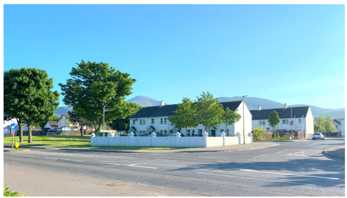
Let's point you in the right...... DIRECTION