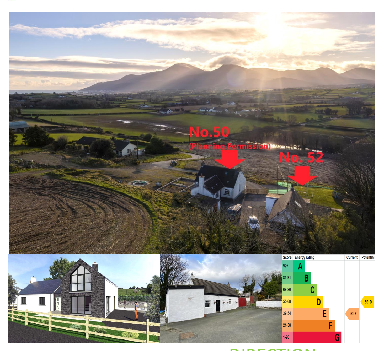
Let's point you in the right...... DIRECTION