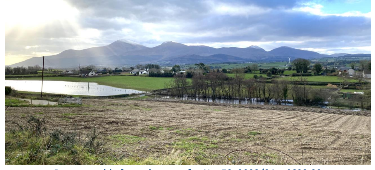
Rates payable for rating year for No. 52 2023/24 = £693.23

If you are considering the sale of your own property, we would be pleased to provide you with a valuation. We are in a position to introduce you to a Financial Adviser in respect of arranging a mortgage, please ask for details. All measurements are approximate and are for general guidance only. Any fixtures, fittings, services heating systems, appliances or installations referred to in these particulars have not been tested and therefore no guarantee can be given that they are in working order. Photographs have been produced for general information and it cannot be inferred that any item shown in included in the property. Any intending purchaser must satisfy himself by inspection or otherwise as to the correctness of each of the statements contained in these particulars. The vendor does not make or give and neither do Property Directions nor does any person in their employment have any authority to make or give any representation or warranty whatever in relation to this property.